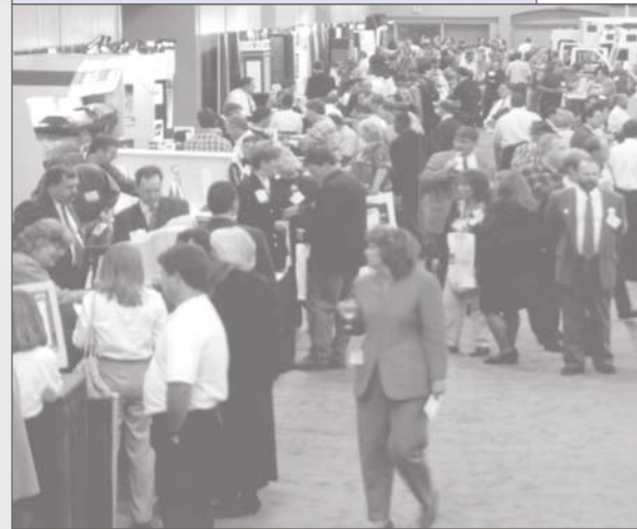
Exhibit Hall Schedule (tentative)